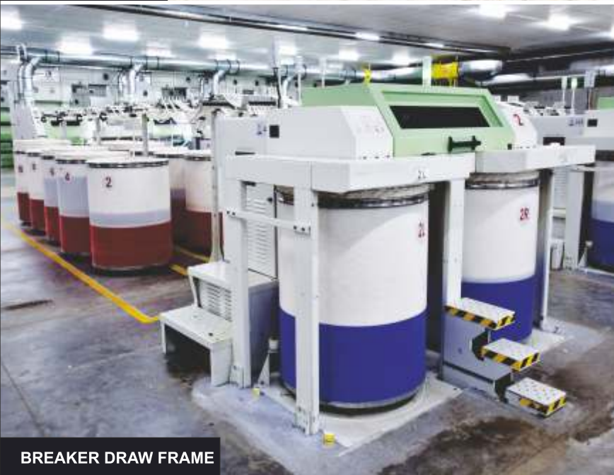
BREAKER DRAW FRAME